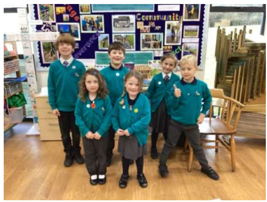
Diary Dates New or amended dates will be shown in BOLD